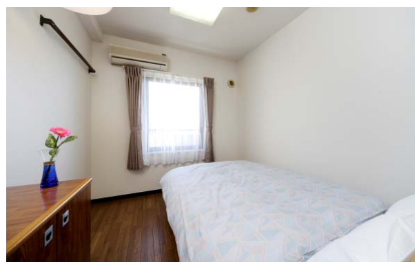
Single room furniture