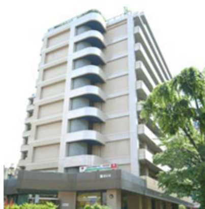
Weekly mansion Kameido

We have made block booking at Weekly-mansion Kameido from July 14th to August 10th . If you need to change the check-in date, please inform us at apss2010@bridge.t.u-tokyo.ac.jp by June the 25th. You can change the check-out date when you arrive at the housing while we recommend students needing accommodation after August the 10th contact us in advance. If you have a particular reason to decline this accommodation and would like to arrange accommodation by yourself, please inform the summer school secretariat by June 25th .