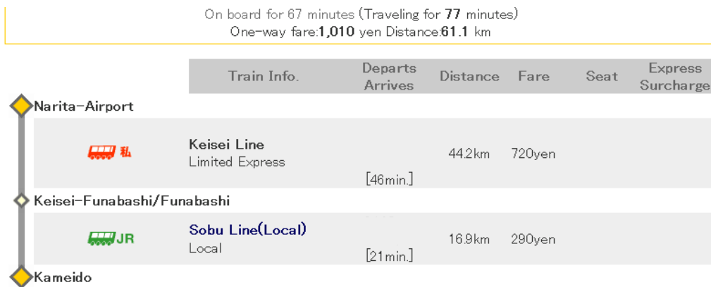
Figure 1. Route from Narita airport to Kameido

After you go through customs, follow signs to Tokyo monorail. Board a Sub Rapid train bound for Hamamatsucho. At Hamamatsucho, change to JR Keihin-tohoku line and board local train to go to Akihabara station, then change to Kameido station. See Figure 2 to learn more about ticket fares and rough traveling distance and time. Refer to A.3. to go from Kameido station to the accommodation.