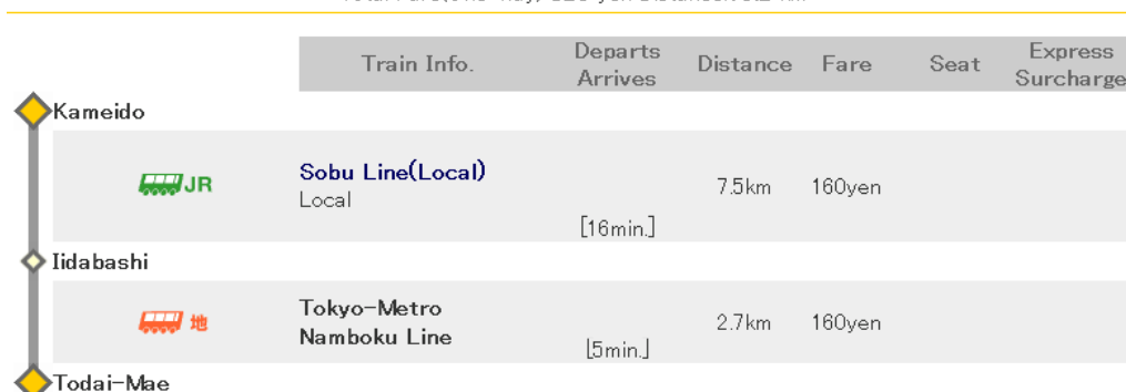
Figure 4. Train route from Kameido station to the University of Tokyo

On board for 21 minutes (Traveling for 27 minutes) Total Fare(One-way) 320 yen Distance:10.2 km