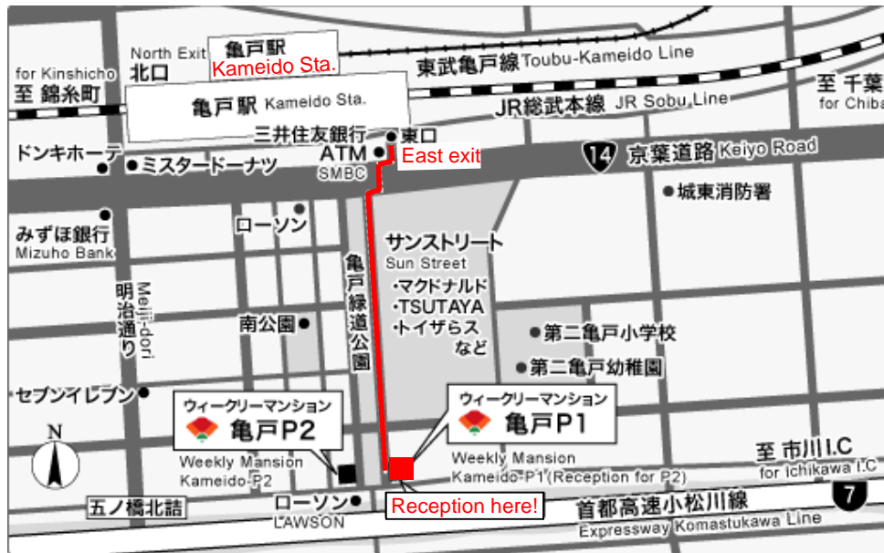
Figure 3. Map around Weekly Mansion Kameido