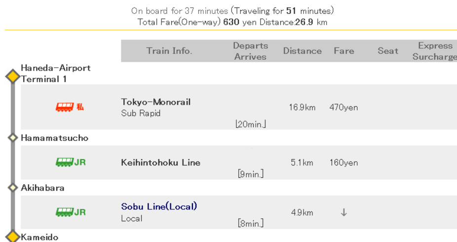
Figure 2. Route from Haneda airport to Kameido